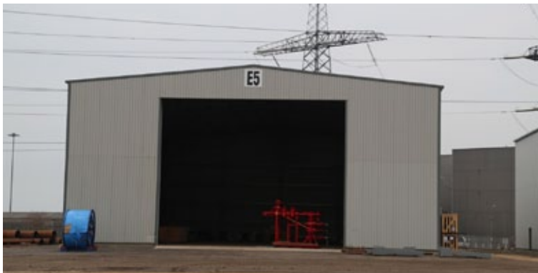
Building E5 Workshop Building 40m x 25m 11m Eaves