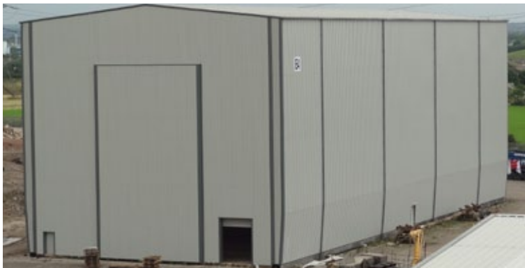
Building E4 Fabrication Hall 64m x 28m 21.4m Eaves Large Access Doors