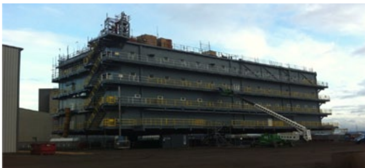
Building E7 (M.A.U) Mobile Accommodation Unit 3,000sq/m over 4 floors - newly refurbished